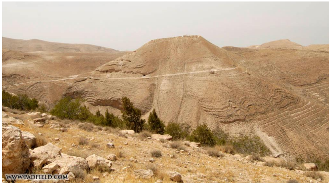
Macharis on top of which John the Baptist was imprisoned