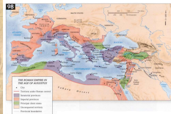
Roman Empire under Augustus